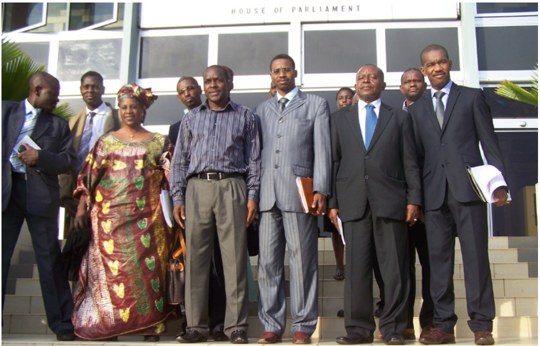
The Malian delegation visiting the Ghanaian Parliament.

A member of the Commite d'appui aux reformes institutionnelles (CARI), responsible for translating the recommendations of Mali's Daba commission into bills, joined the exchange visit to Ghana. After the visit to Ghana and reading the comparative study on election management, published by CMDID, the CARI resolved to change its proposal on Malian election management. In the latest version of the texts proposed by the CARI the president would no longer appoint the chair of the Electoral Commission, and would instead be appointed by the other board members of the Electoral Commission. This would greatly enhance the independence of the Electoral Commission.