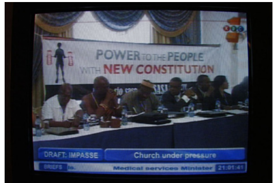
A screenshot of some of the television coverage of Kenya's own constitutional reform process.