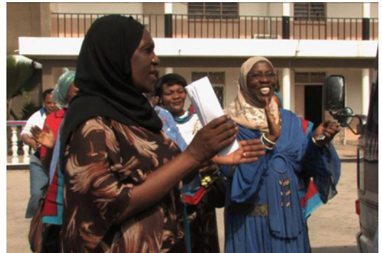
Women delegates from Zambia, Uganda, Burundi and Kenya visit the headquarters of the Tanzanian political party CUF.