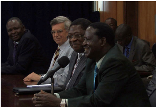
Delegates meet with Kenya's Prime Minister, Raila Odinga.

The recent endorsement of these principles by all political parties is considered a huge plus and helps facilitate the CRC's work in Ghana. Following the exchange visit to Kenya, the Ghanaian political parties acknowledged this best practice and continued to build consensus on proposed amendments to the 1992 constitution. Their common position, as expressed in a joint communique, is another positive step towards a strong and vibrant democratic future for Africa.