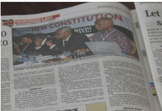
Image from a Kenyan newspaper article covering the exchange visit