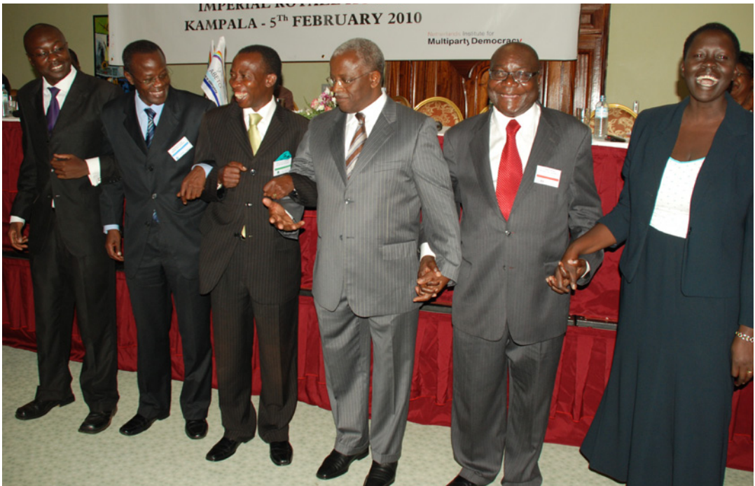
Image from the MoU signing ceremony in Kampala, February 2010.