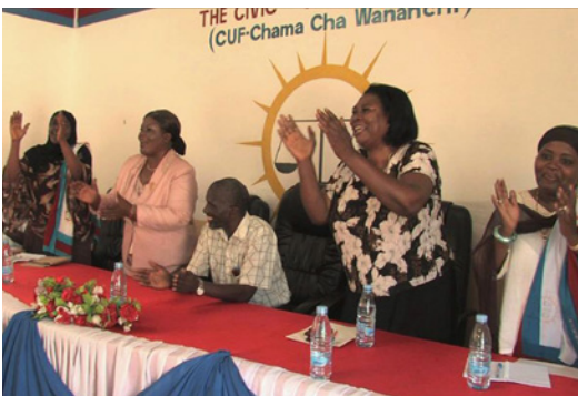
Women from a Tanzanian political party welcome delegates with a song.