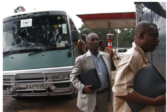
Delegates disembark from their bus, heading for another meeting.