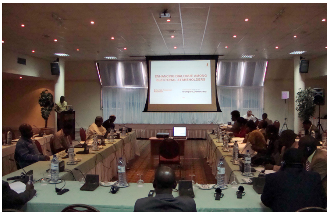
Image from the workshop on enhancing dialogue between electoral stakeholders held in Maputo, September 2009.

This ultimately led to increased understanding of the actions of the CNE, and a reaffirmation of the Electoral Code of Conduct of 2004 by all political parties participating in the 2009 general elections.