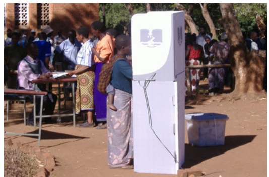
A woman carrying her baby on her back casts her vote at an outdoor polling booth during Malawi's general elections in 2009.