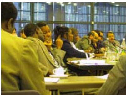
Visitors discuss the functioning of the Parliament

Mr De Beaufort gave an introduction into the functioning of the Parliament. He addressed facts about party structures, the roles of government and opposition in the Parliament, the roles of the Clerk and the Secretary General, the facilities offered to the parties and the salary that members of the Parliament receive. Also the formation of government coalitions was mentioned, a process that can last over 200 days. During that time-period the previous government still controls the country, but isn't allowed to make far-reaching decisions.