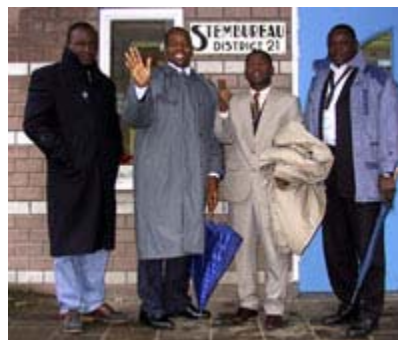
Visitors at Voting District 21