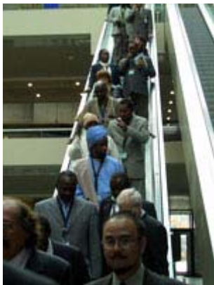
The escalator in the House of Parliament