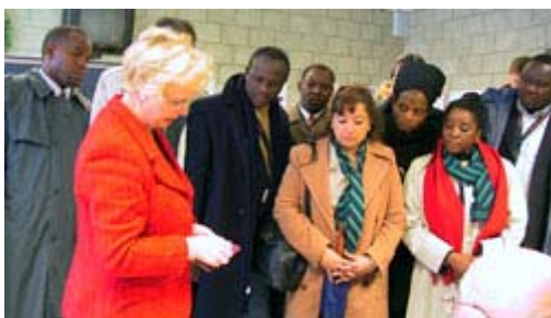
Mrs Van Ardenne casts her vote